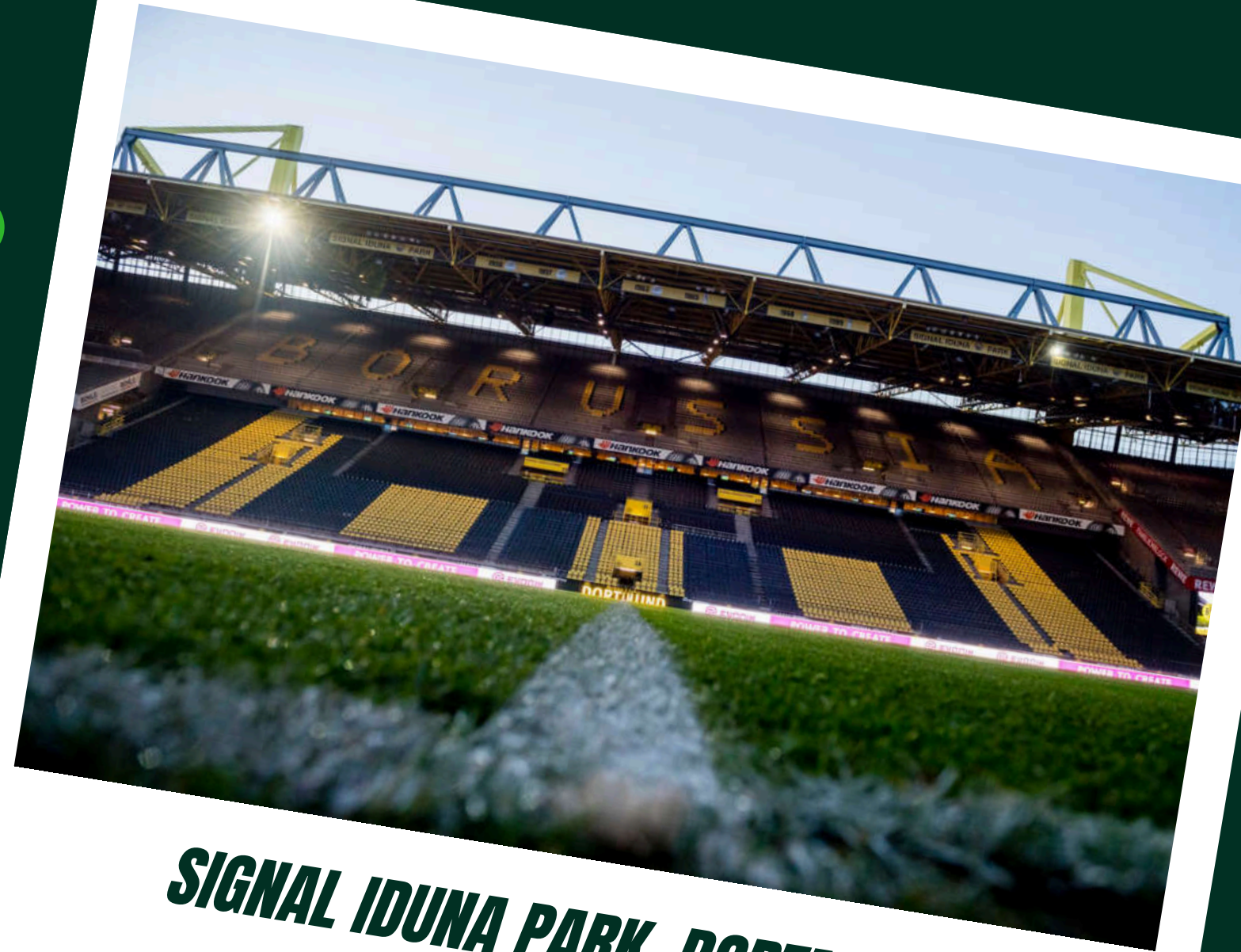
SIGNAL IDUNA PARK, DORTMUND