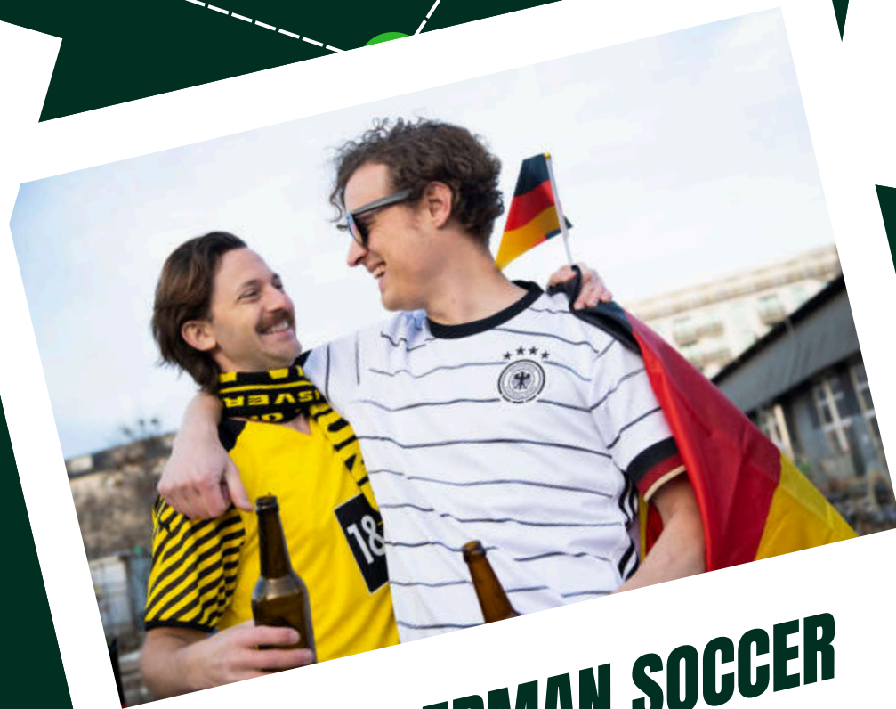
CITY OF GERMAN SOCCER